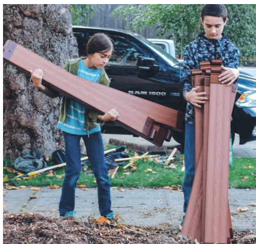
Image Elementary Montlake Elementary Sacajawea Elementary The Island School